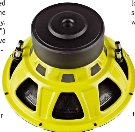
The GZIW 12SPL comes with a paper cone and a well vented frame